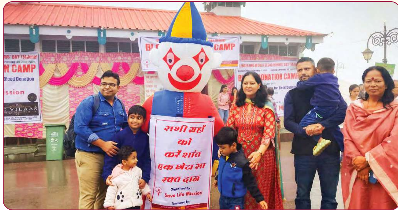
Installation of counter table and oven at Indian Red Cross Society Hamirpur, H.P.