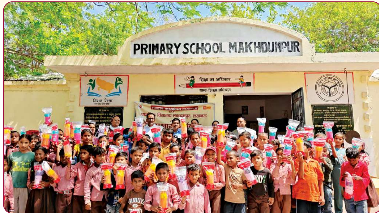
As part of Corporate Social Responsibility, water bottles were distributed to needy students of Primary School, Makhdumpur, Gomti Nagar Extension, U.P.