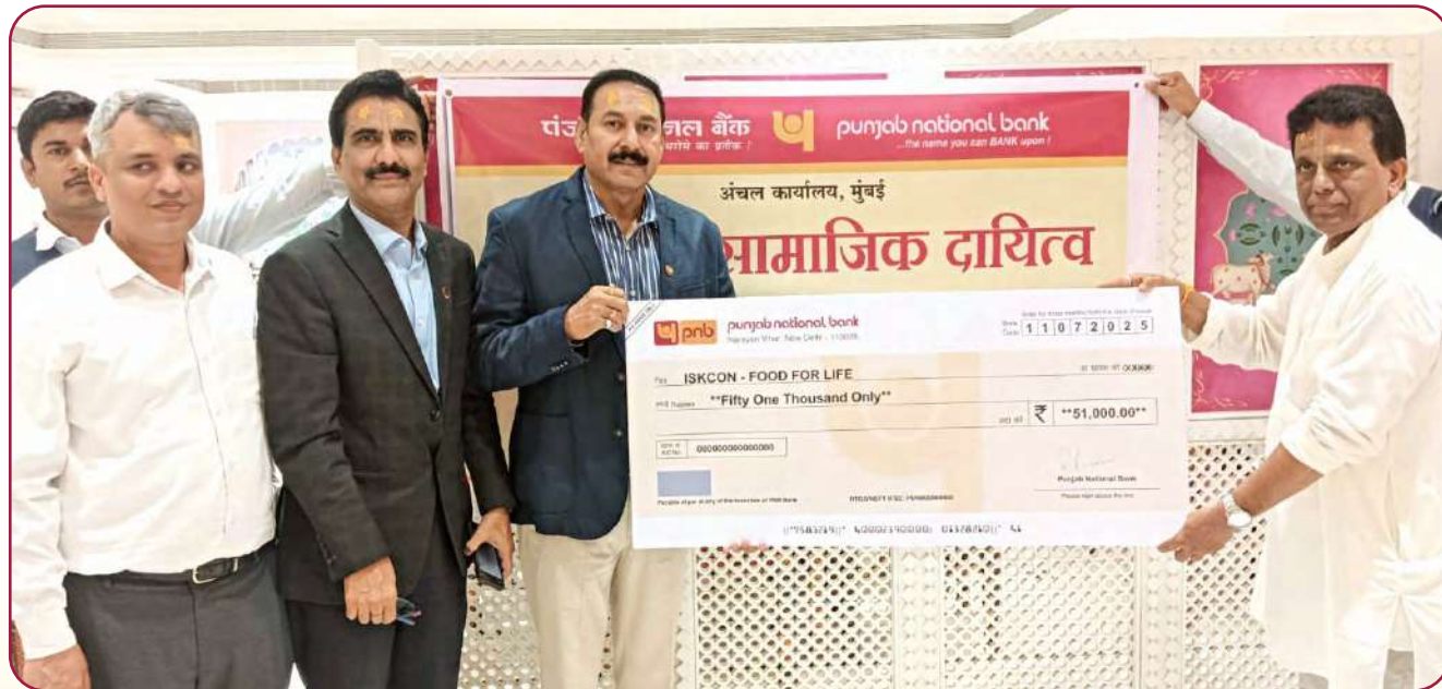
Punjab National Bank, Zonal Office, Mumbai, supported the "Food for Life" campaign run by ISKCON as part of its Corporate Social Responsibility initiative. Under this campaign, needy villagers of Wada, Thane district, benefitted.