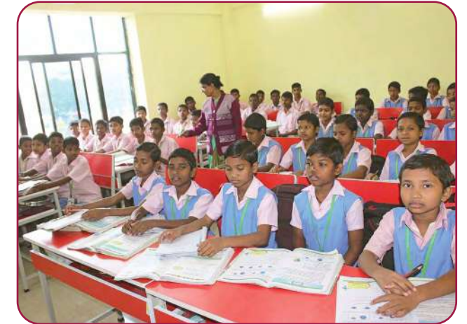
CSR support to Kalinga Institute of Social Sciences (KISS), Bhubaneswar, to fund the education of 100 underprivileged tribal students studying there to nurture the country's future.