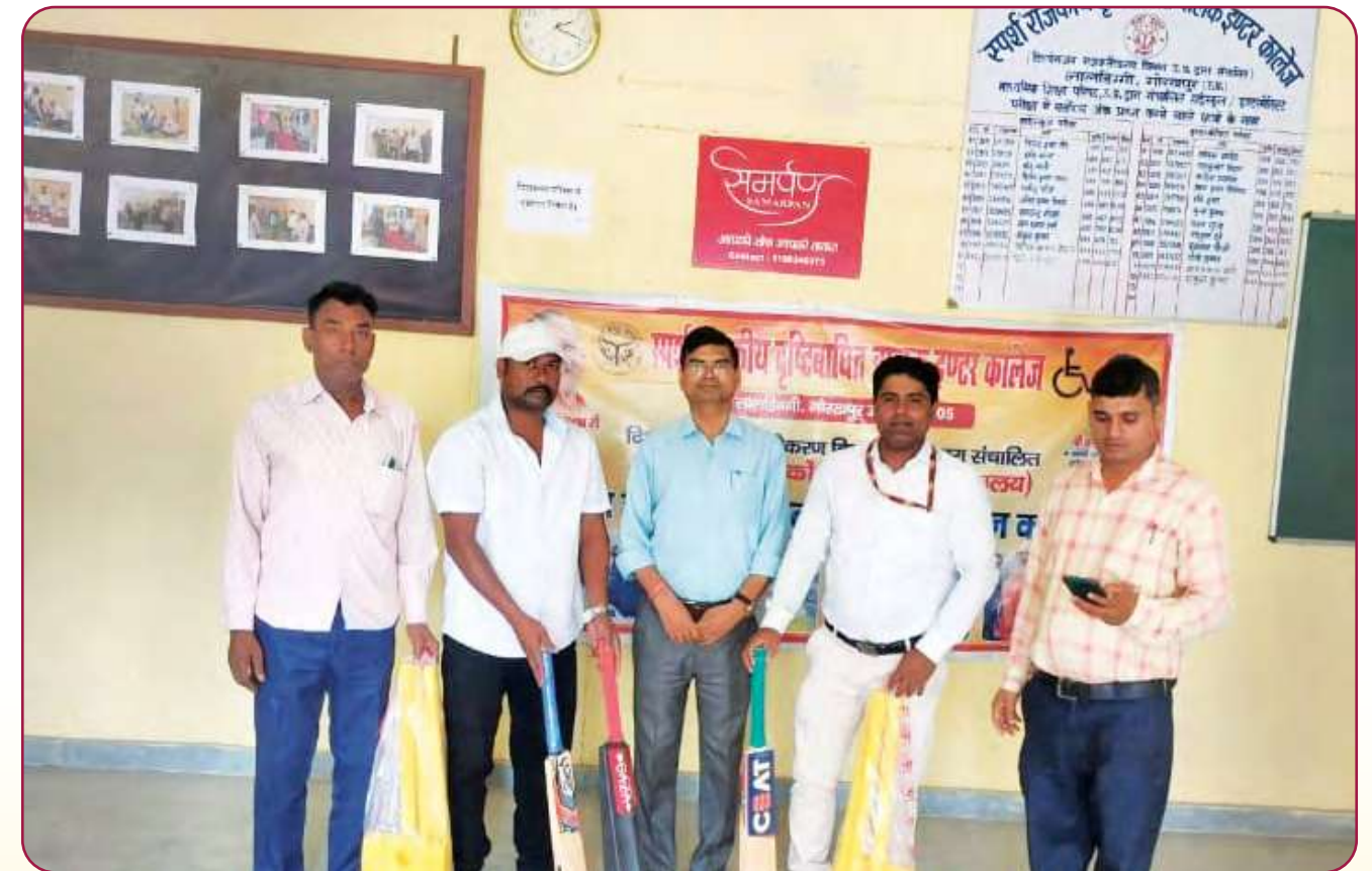
Sports kits were distributed at School in Gorakhpur, U.P. under CSR