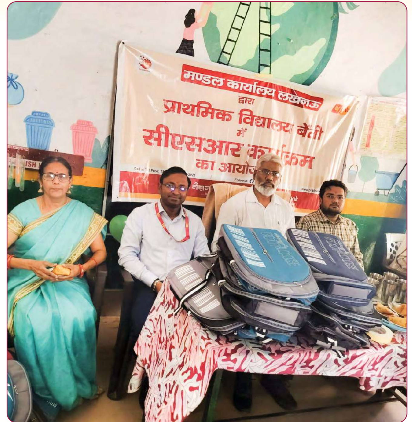
Study material was provided to the needy students of Primary School Benti, U.P.