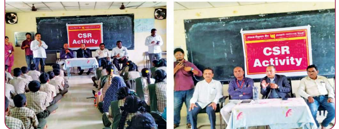
CSR activity at Vijaywada school by donating 2 tables and 22 wall mount fans for benefitting school children by providing necessary infrastructural support.