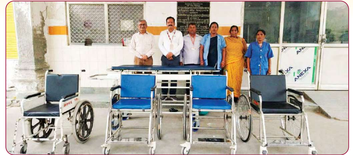
Distribution of wheelchairs and medical equipment at Gorakhnath Hospital, Gorakhpur, U.P.