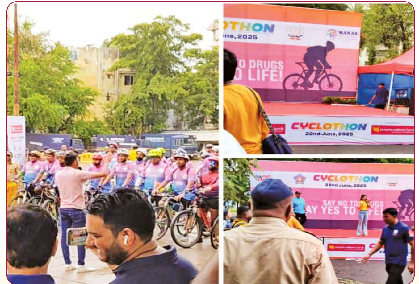
Cyclothon Drug Free India organised by NCB in Mumbai City Circle - Mumbai Zone