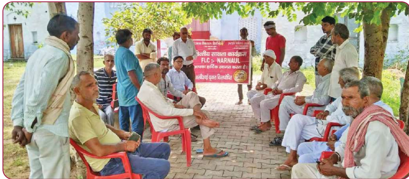
Empowering communities through financial awareness, digital literacy and responsible banking practices