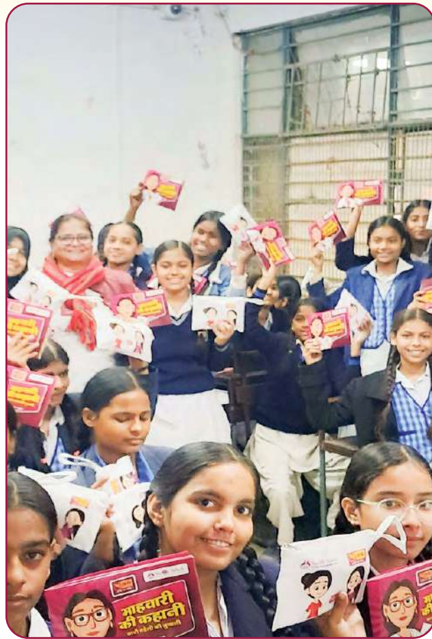
CSR to Sachhi Saheli for Project Chetna 2.0 - Empowering Adolescents through Menstrual Health Awareness & Life Skills Education in Delhi Government Schools