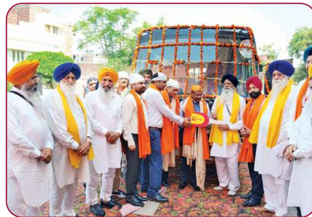
Punjab National Bank donated an air-conditioned bus to the Shiromani Gurdwara Prabandhak Committee (SGPC) for the convenience of pilgrims visiting the revered Golden Temple.