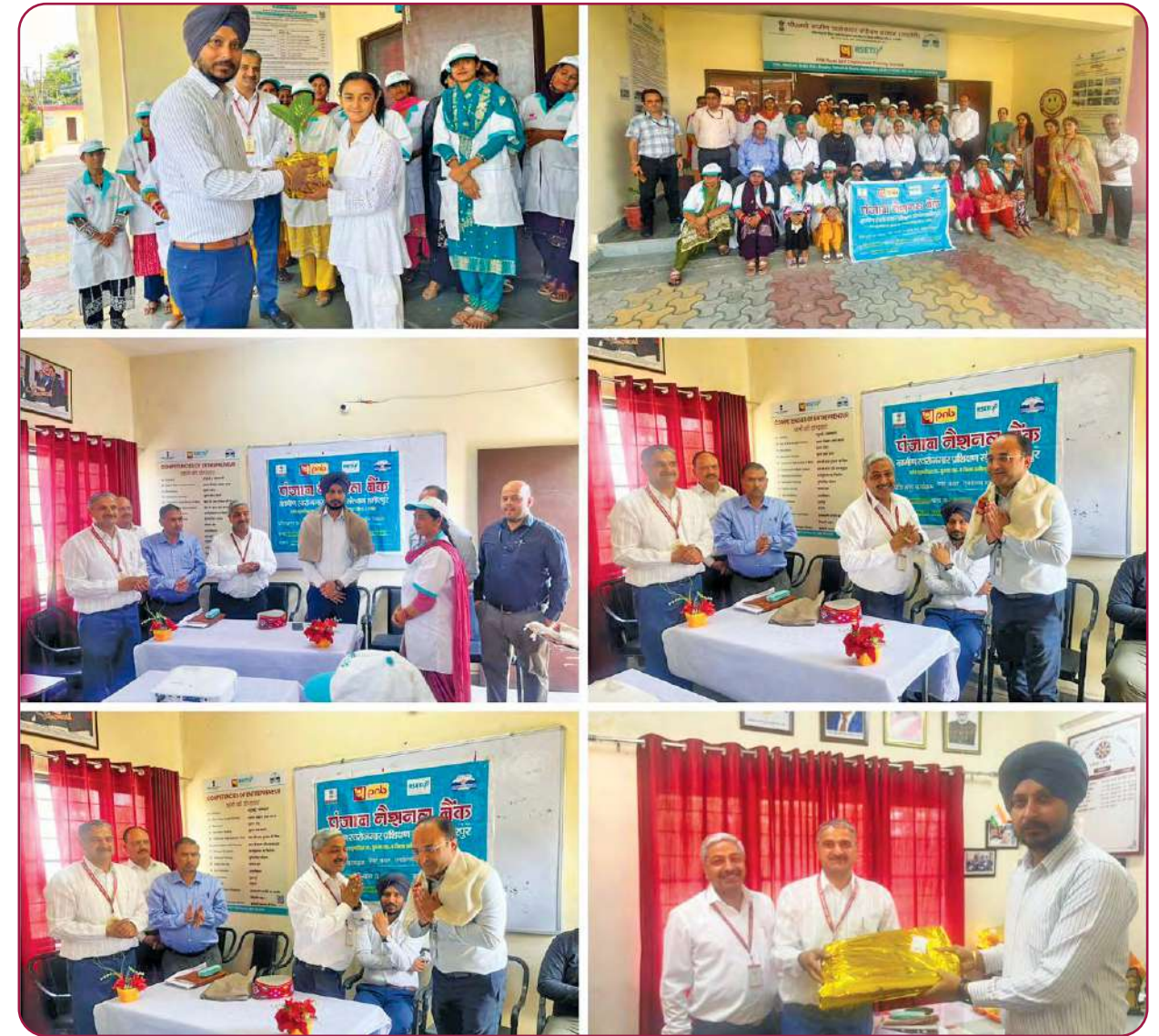
RSETI Skill Development Initiative - Beneficiaries undergoing vocational and entrepreneurship training under various RSETI programmes, empowering individuals with skills and knowledge for self-employment and sustainable livelihood opportunities.

credit for inclusive growth. Total settled candidates are 5,27,399 since inception. The Bank spent Rs.6,175.36 Lakh under this during FY 2025-26.