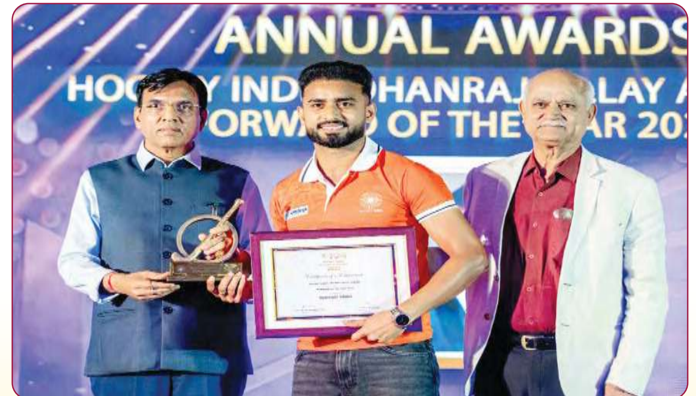
Sh. Sukhjeet Singh receiving Hockey India Dhanraj Pillay Award of the Year 2025 by Hockey India