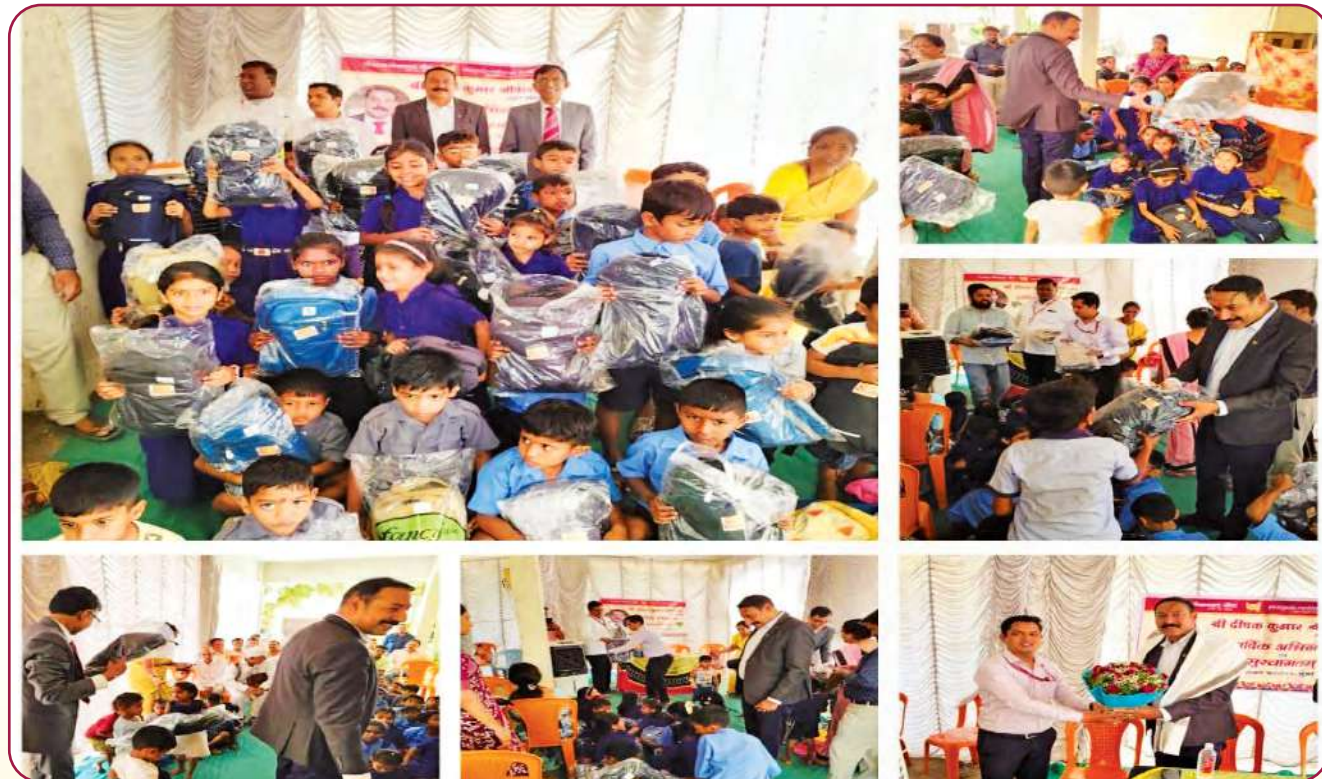
CSR event in UP, where in Bank distributed school bags and water bottle to underprivileged students.