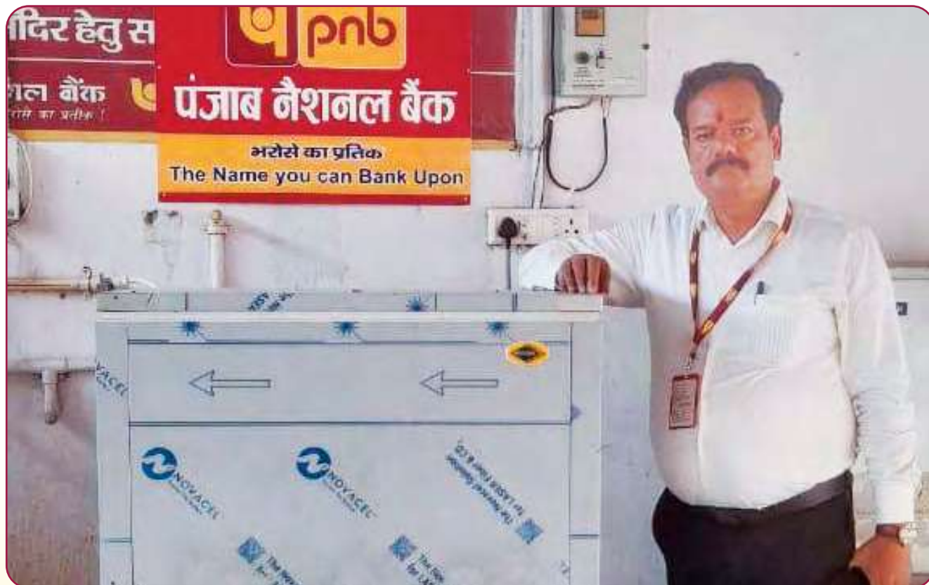
Installation of water cooler at Gorakhnath Temple, U.P.