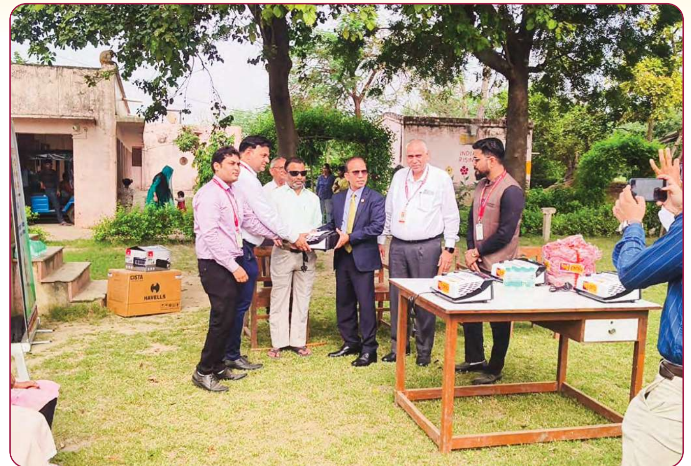
Zonal Manager, Agra, distributing room heaters and dinner plates at Sur Kuti, Runakta as part of a CSR activity