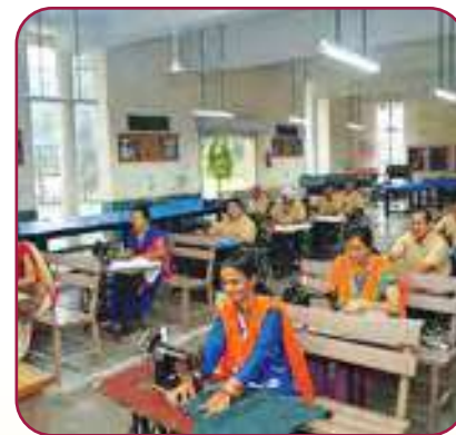
CSR for Rehabilitation Support and Welfare Activities at Paraplegic Rehabilitation Centre (PRC), Mohali