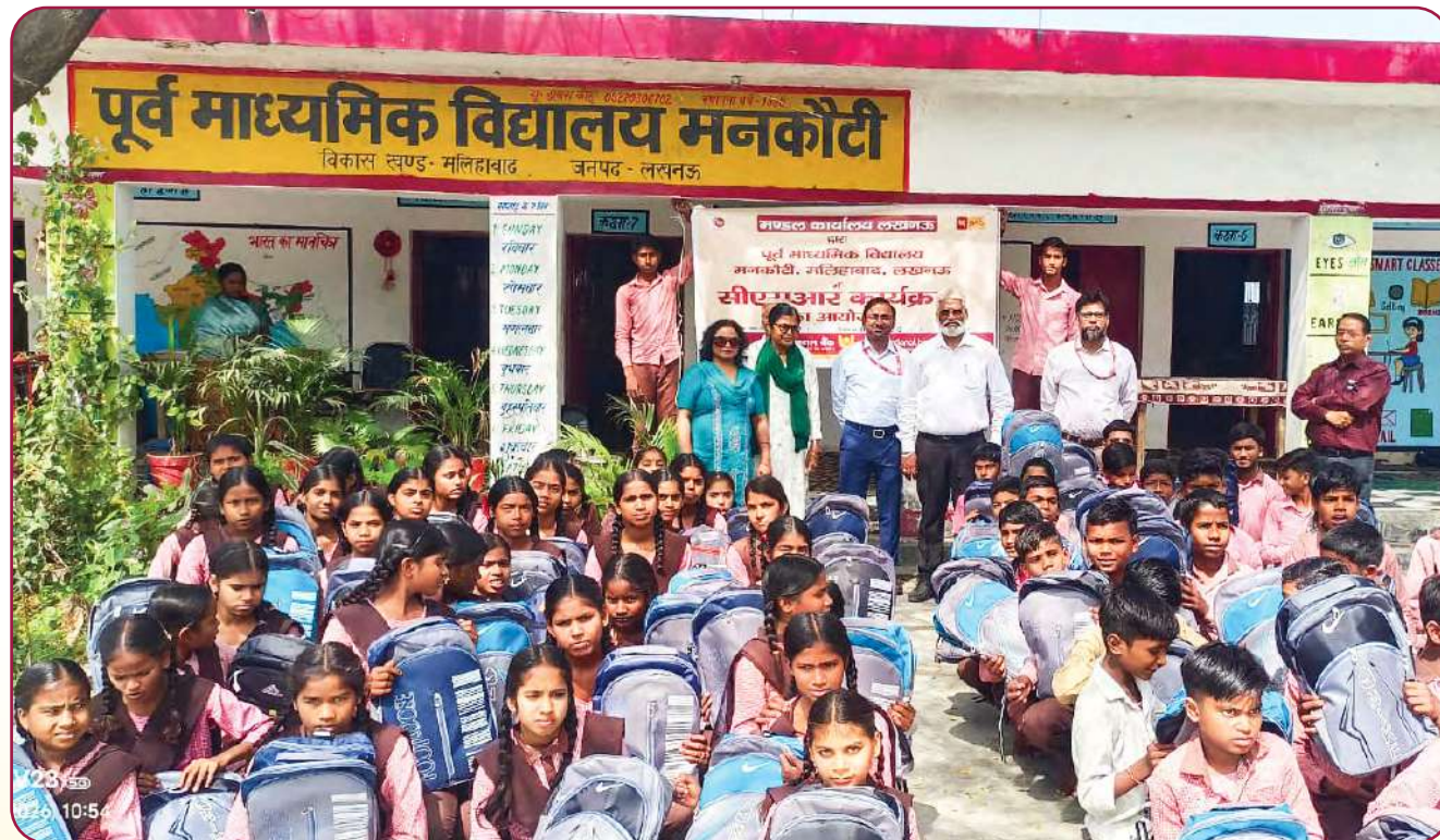
Providing study material to needy students of Pre-Primary School, Mankauti, Malihabad