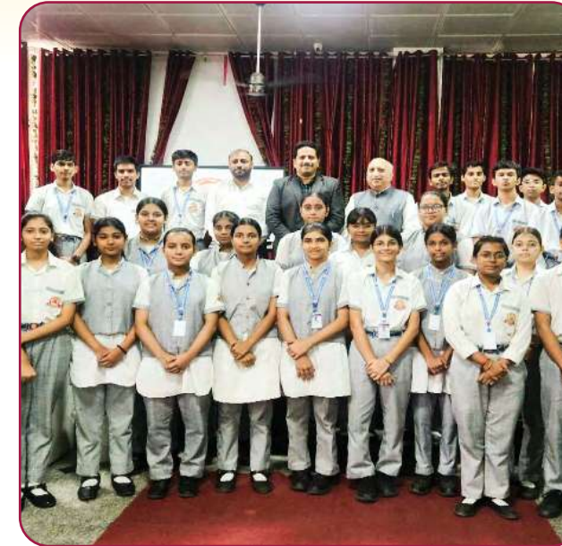
CSR support to Yuva Unstoppable to provide scholarships to 100 students under the PNB Rising Stars initiative for a brighter future.