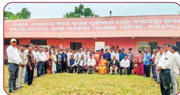
Empowering farmers through knowledge sharing, skill development and sustainable agricultural practices.

dairy farming, mushroom production, maintenance of tractor and other farm machineries, processing and preservation of fruits and vegetables, computer courses, beauty parlour, candle and soap making, papad making, making of soft toys, cutting, tailoring & embroidery, etc. These Training Centres have been equipped with the Mobile Van and LED for audio visual display of informative video clips to the farmers. During the FY 2025-26 - Total 1,10,061 persons were trained in these centres. Out of which 52,439 were women. Since inception, FTCs have imparted training to 20,42,240 persons out of which 5,08,710 were women. The Bank spent Rs. 1294.71 Lakh under this during FY 2025-26.