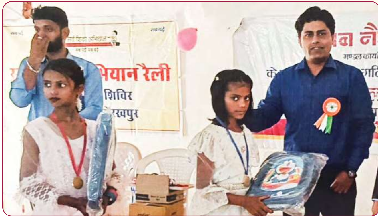
Sports kits, carry bags and food packets were distributed at Rajhi Primary School, U.P