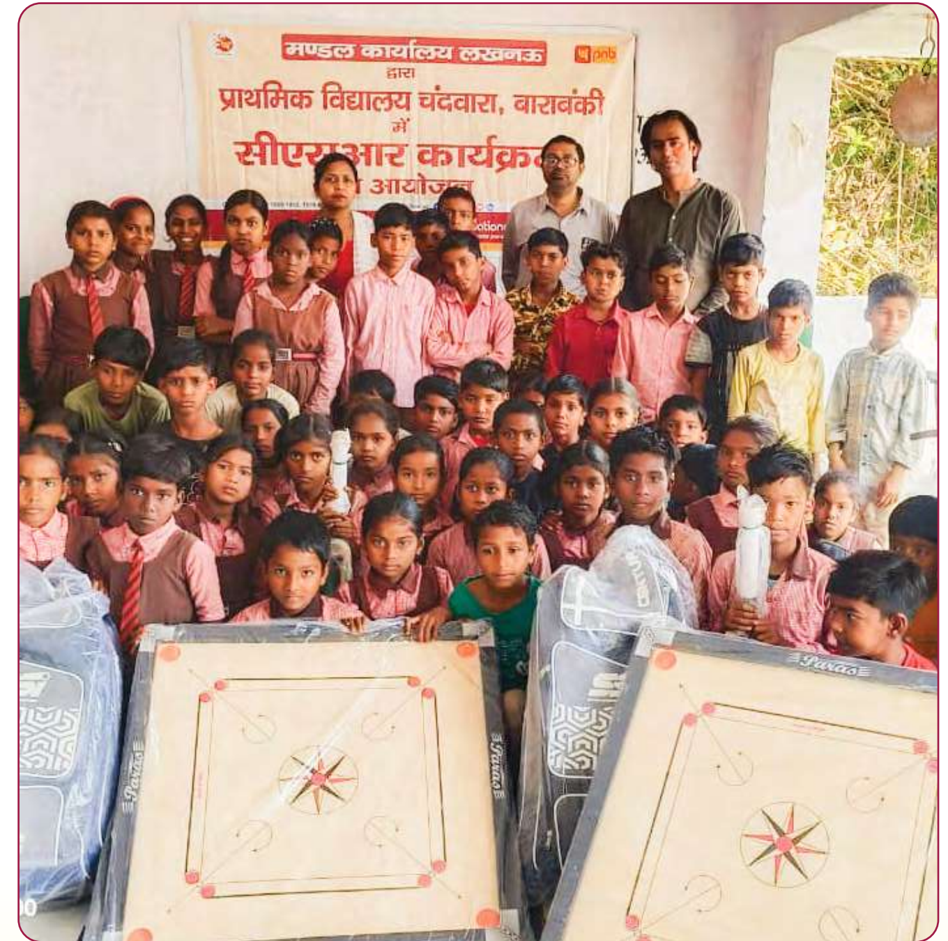
Providing sports equipment to the needy students of Primary School, Chandwara