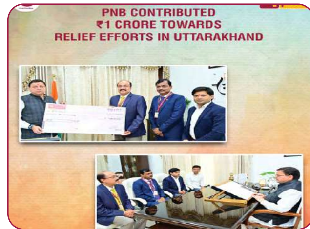
Punjab National Bank contributed ₹1 crores towards relief efforts in the disaster-affected areas of Dharali and Harsil in Uttarkashi district, Uttarakhand.

"Giving back to the society" is the prime motive behind our CSR activities. The message that we give to our staff regarding CSR is that whatever we do today will have an impact on future generations. Thus, we undertake CSR activities with active participation of staff members and participation of local populace.